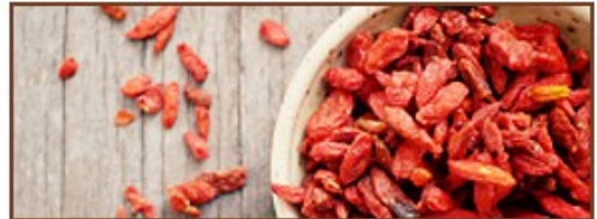
3 Additional Ingredients

Ginseng berry, Siberian ginseng, Chinese matrimony vine